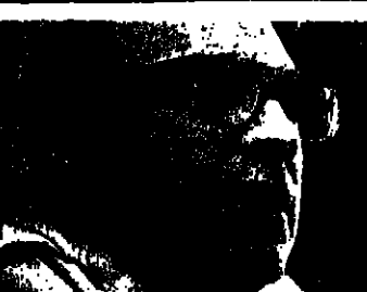
Science and Technology Minister Yuval Ne'eman... "the best of both worlds."

Ministry headed by Tehiya's Yuval Ne'eman.